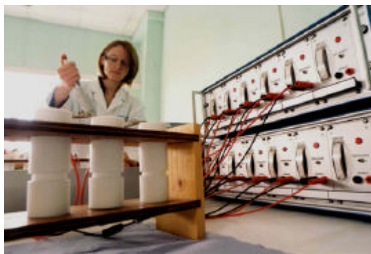
Electro deposition in the Environmental Radiochemistry laboratory